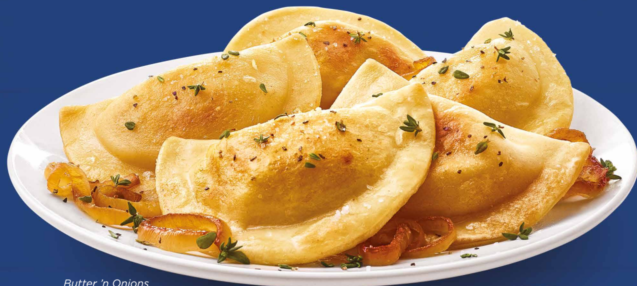
Butter 'n Onions

As a savory, satisfying combination of pasta, creamy whipped potatoes, hearty cheeses and other premium ingredients, Mrs. T's® Pierogies are the deliciously simple, easily prepared comfort food that's right for every healthcare menu, recipe, and palate.