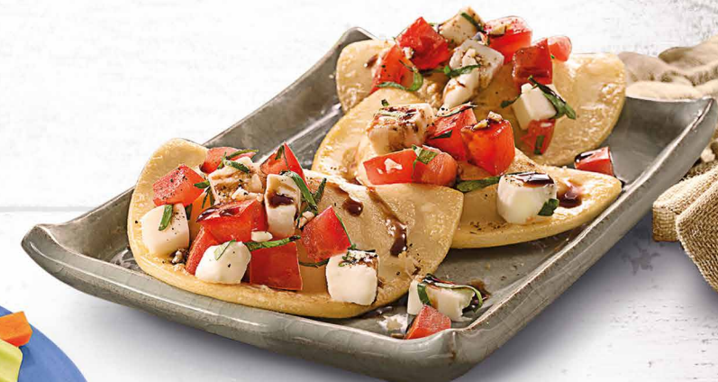
Garden Fresh Pierogy Bruschetta