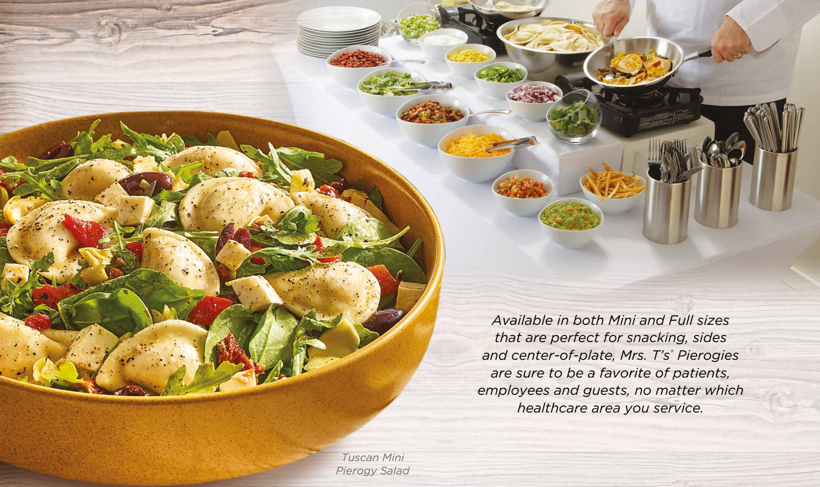
Tuscan Mini Pierogy Salad

Available in both Mini and Full sizes that are perfect for snacking, sides and center-of-plate, Mrs. T's® Pierogies are sure to be a favorite of patients, employees and guests, no matter which healthcare area you service.