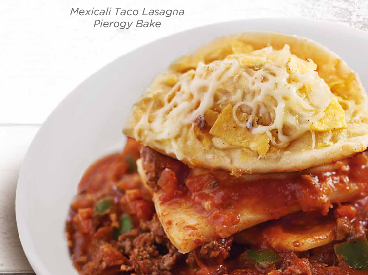
Mexicali Taco Lasagna Pierogy Bake