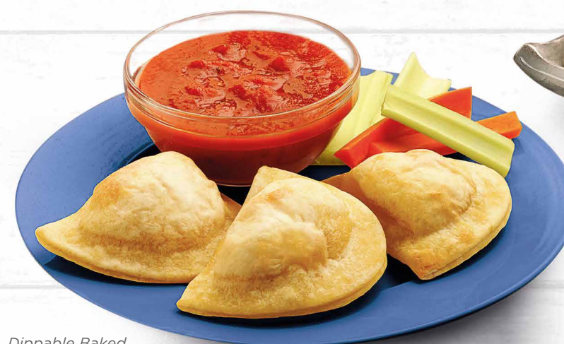
Dippable Baked Pierogies