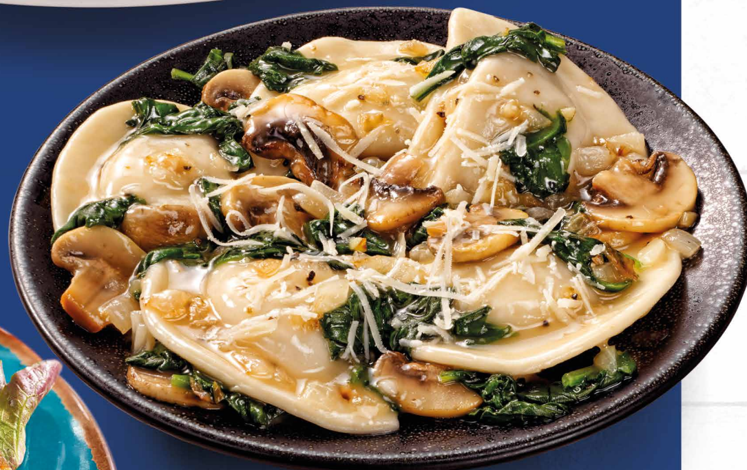
Baby Spinach & Mushroom Pierogies