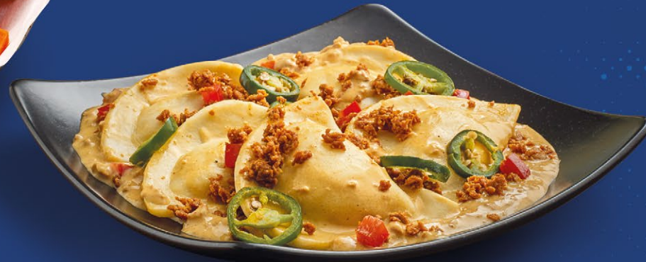
Creamy Jalapeño & Chorizo Pierogies