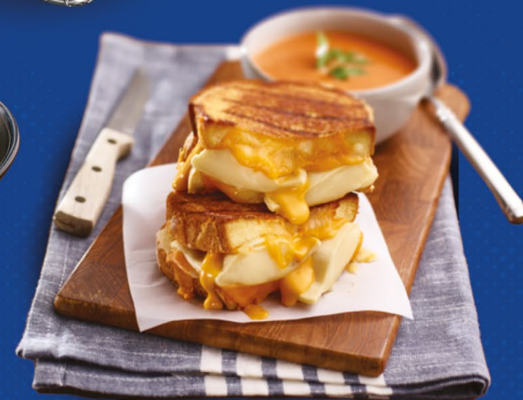
Pierogy Grilled Cheese