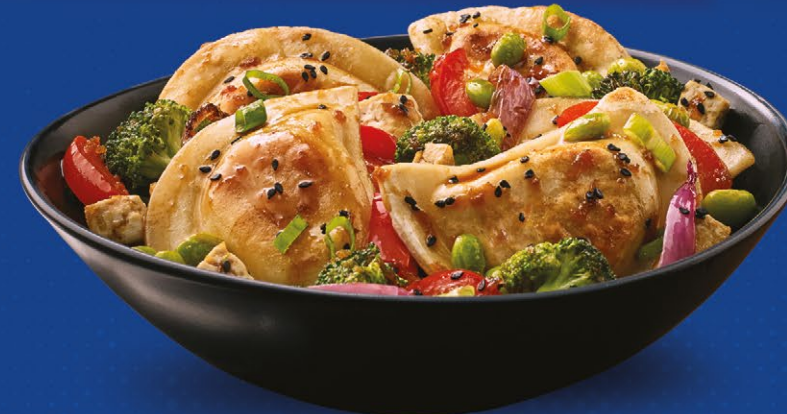
Sesame Ginger Pierogy Bowl