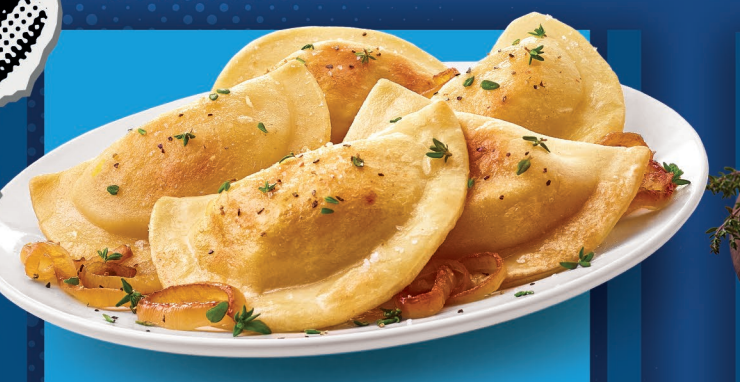
INTRO TO CULINARY CLASSICS Classic Butter & Onion Pierogies

Here at Mrs. T's Pierogy University, we've got the fundamentals of flavor down to a science. Study up on all the tastiest ways to master your menu, and major in the costefficient, mouthwatering favorites that your students will love!