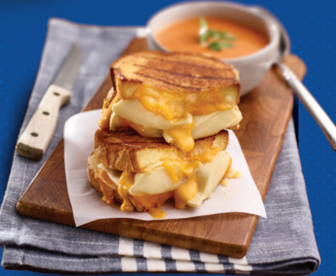
Pierogy Grilled Cheese