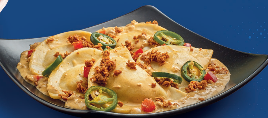
Creamy Jalapeño & Chorizo Pierogies