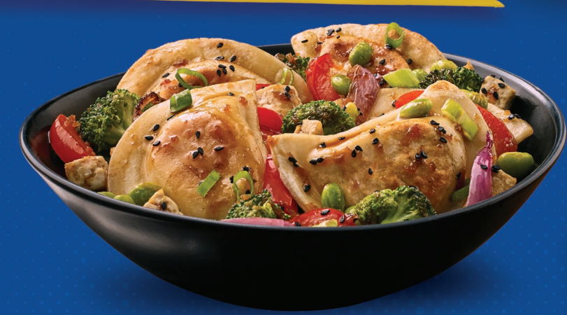
Sesame Ginger Pierogy Bowl