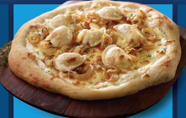
LATE NIGHT CRAM SESSIONS REQUIRE PIZZA! White Pierogy Pizza